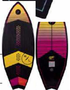
*Limited Edition Colors