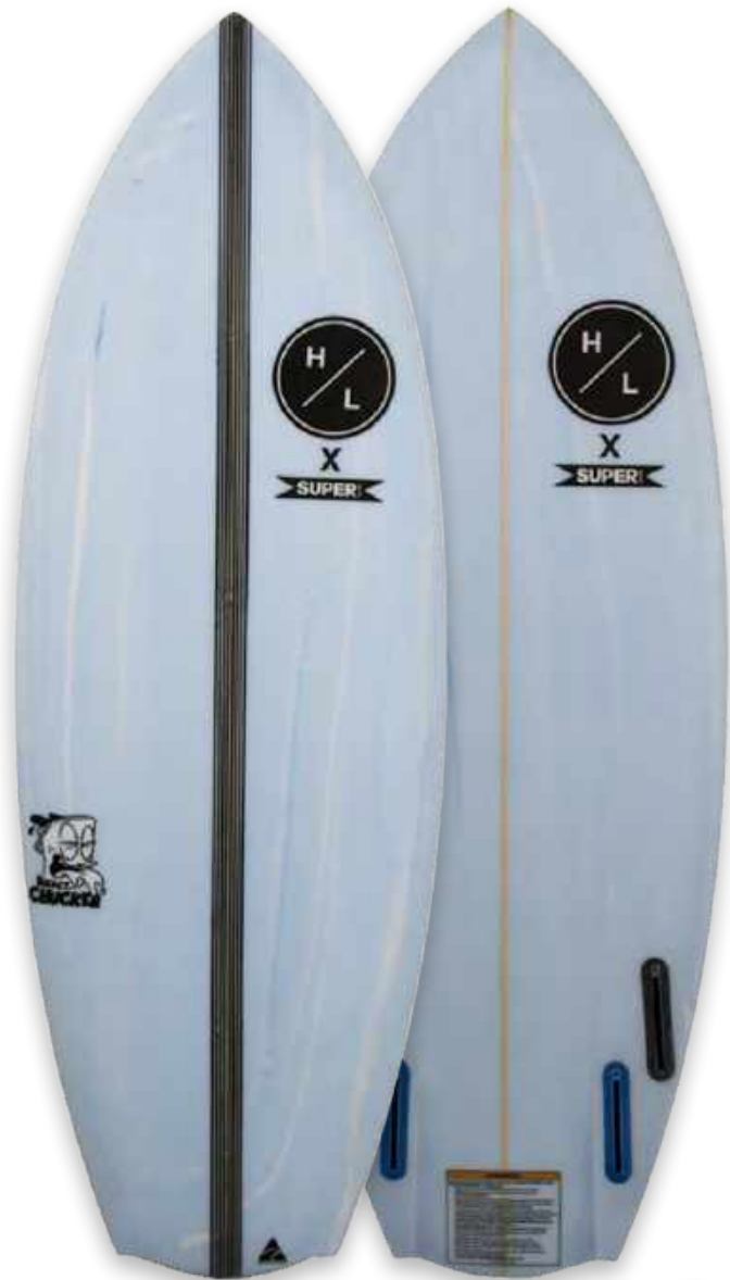
TOP *5'0" size shown above

Wide body super shape with a floaty feel.