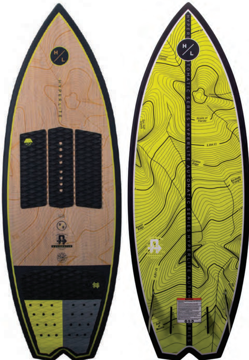
5.0' size shown

Delivering a floaty surf vibe from the beaches and wakes of Florida.